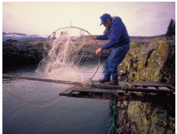
Lyle Point, Washington, a tribal fishing site on the Columbia River.

The National Marine Fisheries Service (NMFS) and the U.S. Fish and Wildlife Service (FWS) share authority for implementing the Endangered Species Act. The NMFS is responsible for marine resources while the FWS is responsible for freshwater inland resources. This split has caused significant difficulty with administering salmon recovery since the major impact on the fish is from inland development.