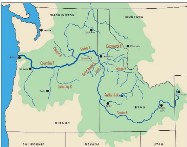
FIG. 1 The Columbia River Basin

Recovery efforts, i.e., preventing extinction, have been surrounded by conflict and controversy. Much of these expensive and ineffective recovery efforts has been based on patently flawed implementation of the ESA. Opportunities to enhance recovery strategies were systematically subverted by the Bush administration. The federal court repeatedly has ordered compliance so that the court, and not the agencies, directs most of the recovery activity. But this provides only piecemeal, short-term fixes while the fish populations continue to decline. This report documents recommendations that, if implemented, could significantly improve the success and efficiency of recovery actions in the Columbia River Basin.